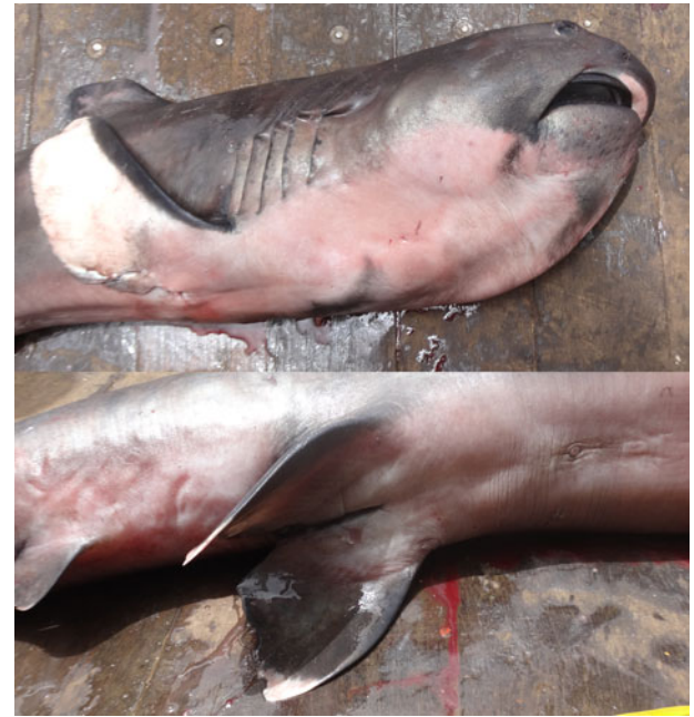
Fig. 2. Photos of the 180 cm juvenile female megamouth shark caught in 2018 near the coast of Mauritania.

bycatches are found associated with FOB sets than free school sets although this can vary depending on the species (Clavareau et al. , 2020). Regarding the rest of the companion species in the fishing sets, we found other elasmobranchs and tuna, and/or billfishes in all cases. Among the elasmobranchs and manta rays ( Mobula spp.), shortfin mako Isurus oxyrinchus and silky shark Carcharhinus falciformis were the species identified, in addition to two pelagic stingrays Pteroplatytrygon violacea , and one unidentified carcharhiniform shark, which were caught in the Indian Ocean. These species are among the most common bycatch elasmobranch species in the tropical purse seine fleet (Amandé et al. , 2010; Hall & Roman, 2013; Clavareau et al. , 2020). The catches of elasmobranch and billfishes were limited in all instances presented here, no more than two individuals/set, while the catches of the target species Thunnus albacares and Katsuwonus pelamis were between 2 and 21 tons.