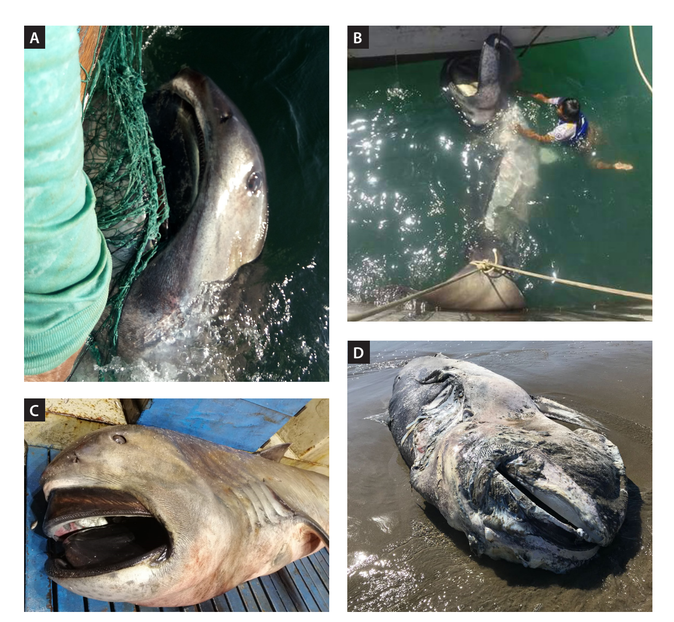
Figure 2. Megamouth Shark captures in Peru. A. Incidentally captured in a driftnet off Piura. B. Being lifted from a vessel to the Los Organos landing site, Piura. C. Captured by a purse seine net off Lambayeque. D. Stranded at El Ñuro, Piura.

to 17:19 h; the retrieval of the net started at 06:06 h at 05.4428°S, 082.2357°W and effectively finished at 09:01 h at 05.4685°S, 082.2390°W. The exact location of the encounter was not recorded (Fig. 1). The shark was alive and entangled in the driftnet, but fishers removed the gear and released the shark. The fishing crew was familiar with M. pelagios , which they call "bocón" (big mouth), and usually release, claiming the meat is watery and not palatable (Fig. 2A). The presence or absence of claspers could not be evaluated, so the sex was not determined. Tissue samples were not collected from this individual.